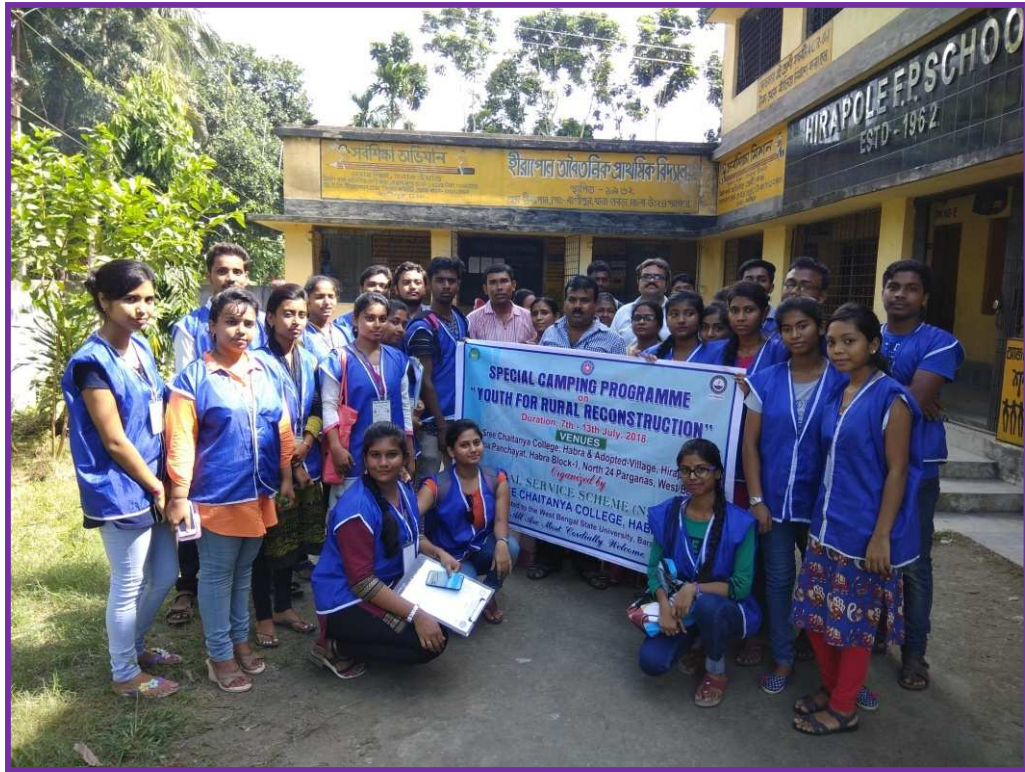
Image 26: SCP: After the Programme at Hirapole Free Primary School.