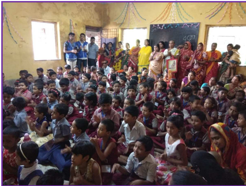
Image 24: SCP: Active participation of NSS Volunteers, Students and Guardians throughout the programme at Hirapole Free Primary School, Hirapole, Adopted village.