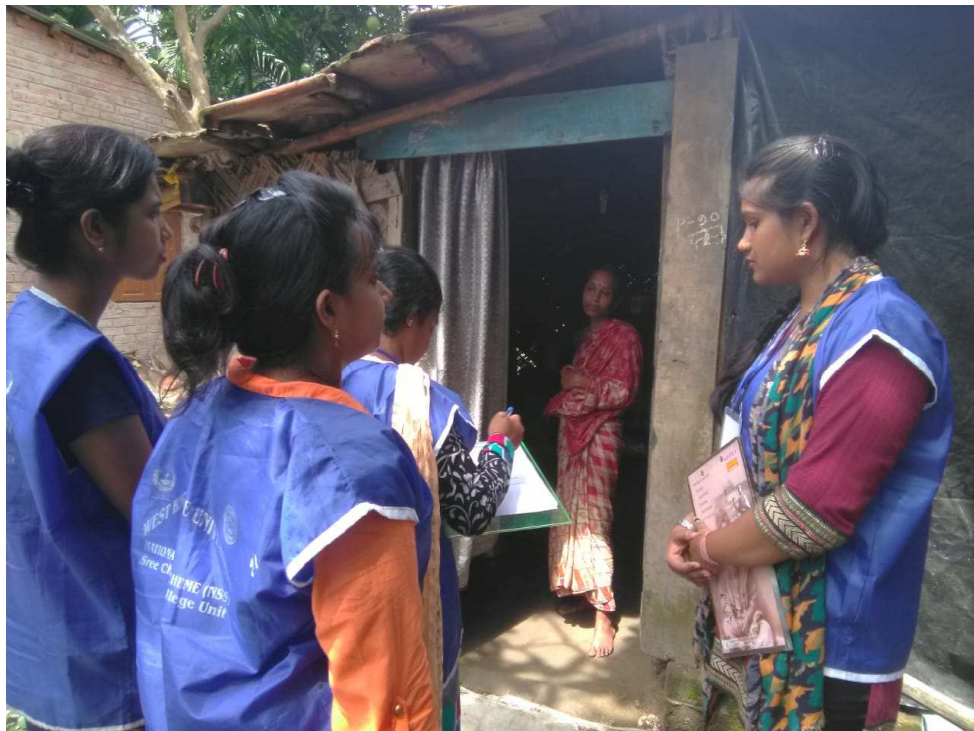
Image 30: SCP: Field Survey and Data Collection drive at adopted village Hirapole on 'Rural Waste Management'.