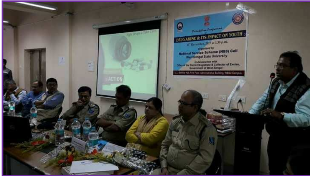
Image-5: We actively participated in the Orientation Programme on 'Drug Abuse & Its Impact on Youth' at WBSU