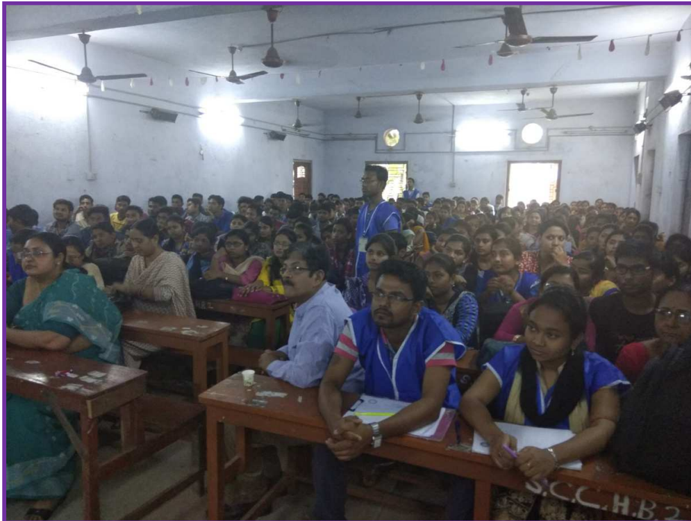
Image 8: Thalassaemia Awareness and Blood Sample Collection Camp: Participants listening with rapt attention.