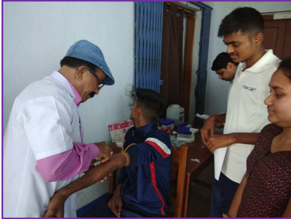
Image 7: Thalassaemia Awareness and Blood Sample Collection Camp: Blood Collection. Participants listening with rapt attention.