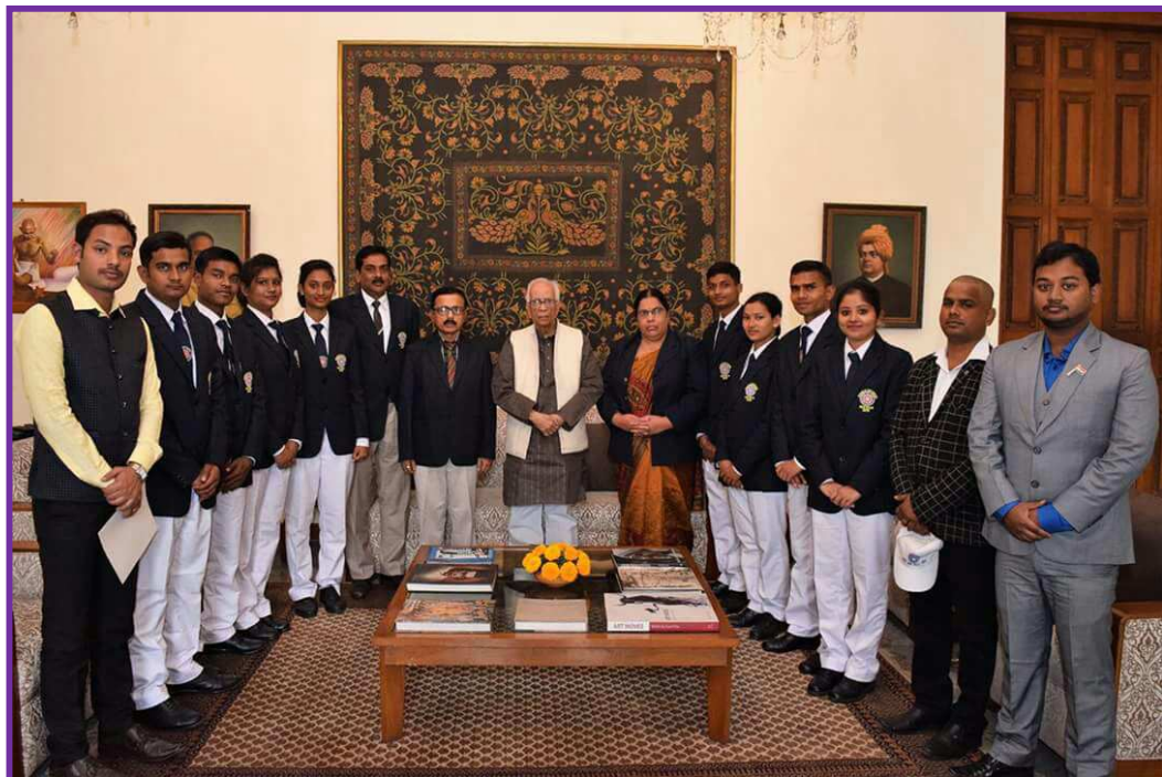
Image 4: Governor of West Bengal Meet with NSS Contingent after National Republic Day Parade 2018.