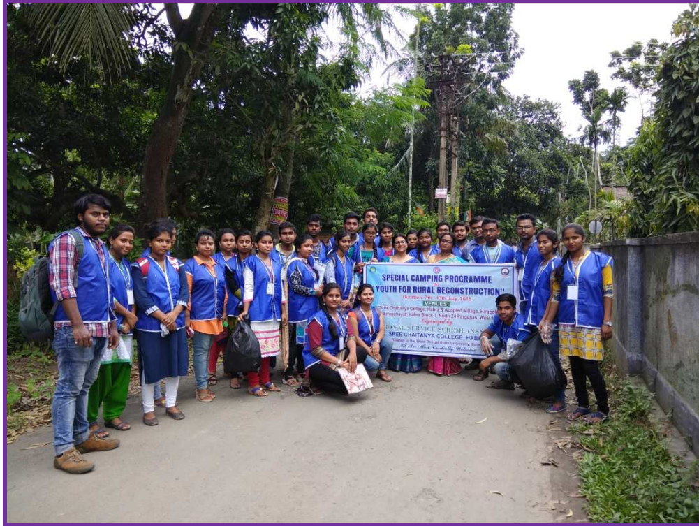
Image 25: SCP: Active participation of NSS Volunteers for Village road cleaning.