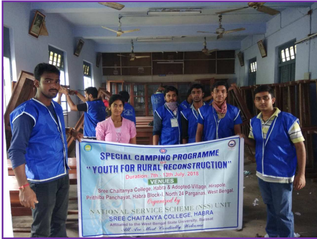
Image 19: SCP: Cleaning Drive at Central Library, Sree Chaitanya College, Habra