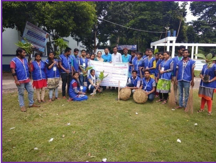
Image 13: Swachh Bharat Summer Internship Programme 2018: Our NSS Unit takes several initiatives under the Swachh Bharat Summer Internship Programme from 10 th May to 30 th July, 2018.