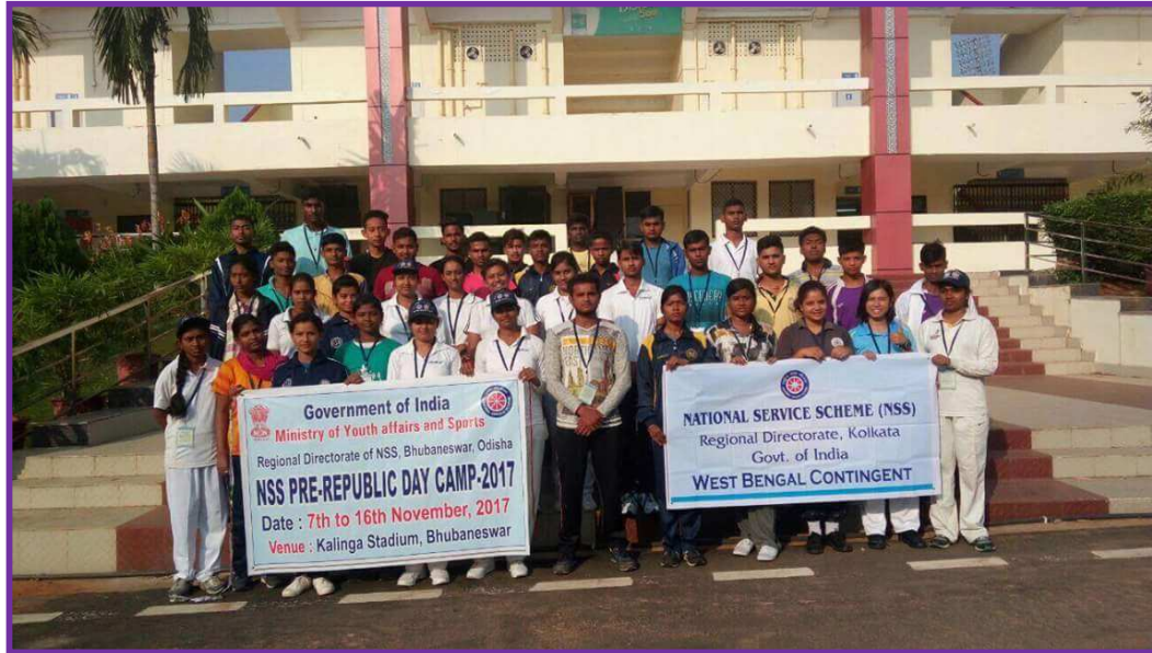
Image-1: NSS Pre-Republic Day Camp-2017 at Kalinga Stadium, Bhubaneswar, Odisha